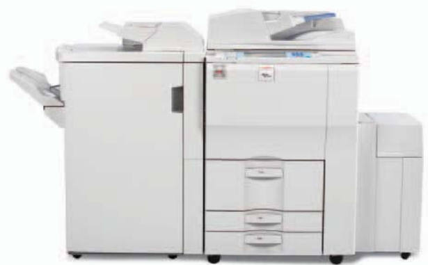
The Ricoh Aficio MP 7500, shown with the 100-sheet Staple Finisher, Cover Interposer and Large Capacity Tray, prints at 75 pages per minute.