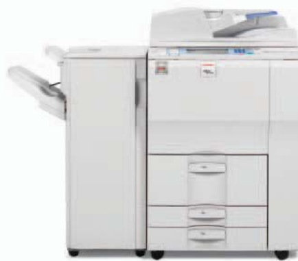
The Ricoh Aficio MP 6500, shown with the 50-sheet Staple Finisher, prints at 65 pages per minute.