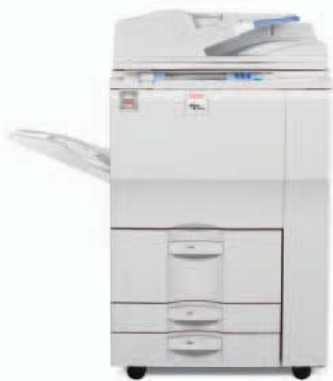
The Ricoh Aficio MP 5500 prints at 55 pages per minute.